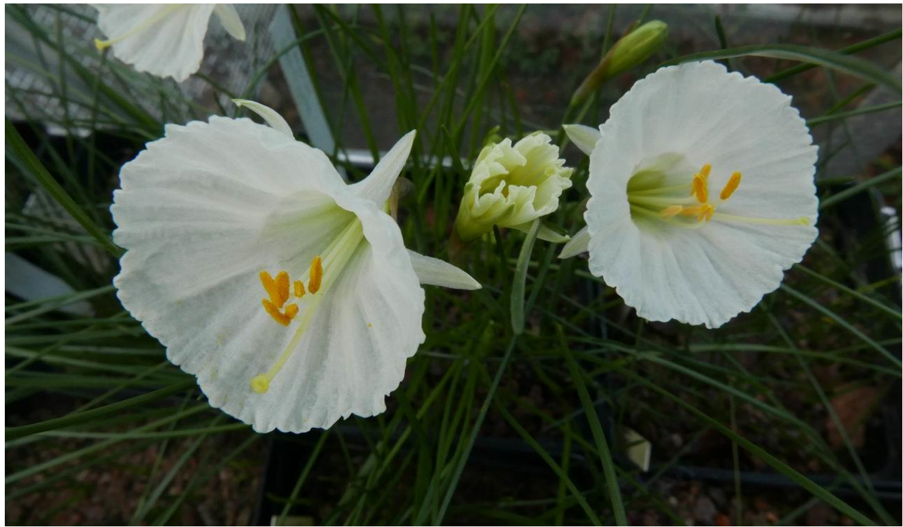
Narcissus 'Craigton Chorister'

The ongoing expansion of the sand beds where all the bulbs are planted directly into sharp sand has seen what was the Fritillaria house completely converted— the one on the left was converted this summer the other two were done last year. Now instead of the rows of pots which I have had for over thirty years I have the new excitement of indoor bulb beds to plant in my informal way.