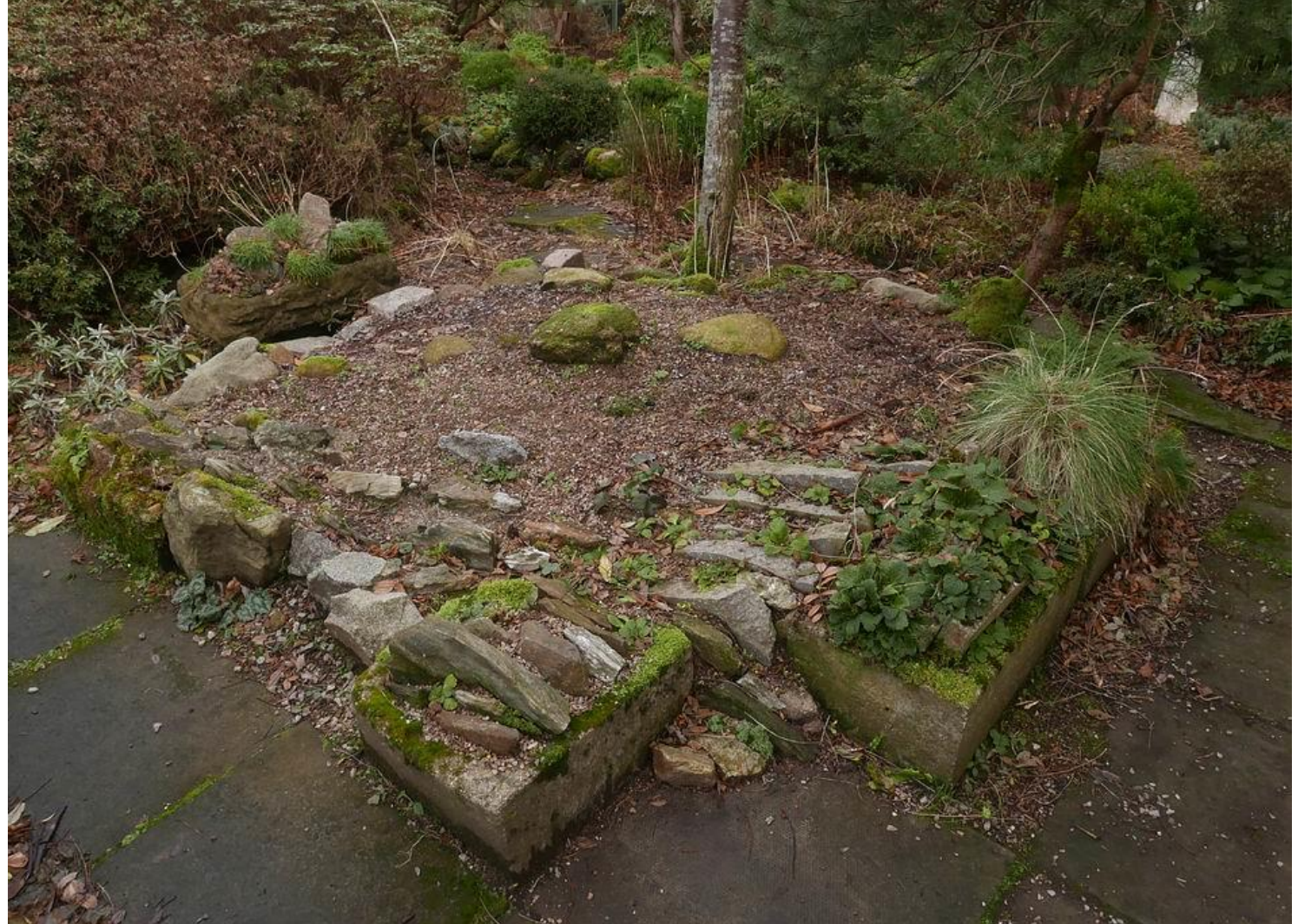
I constructed this new bed beside the pond in the summer and have been planting it up through the autumn in my inevitable informal and un-labelled way so I am excited to see what comes up in the spring. Once I see how it looks I will work to enhance it further with compatible plants.

Looking forward to next year some of the projects I have been working on will continue such as this area I am reclaiming from the shrubs. Cutting them back or removing the lower branches will open up the ground level for further planting opportunities. I have already started the area in the bottom left and in time hope to open all the area behind the seat.